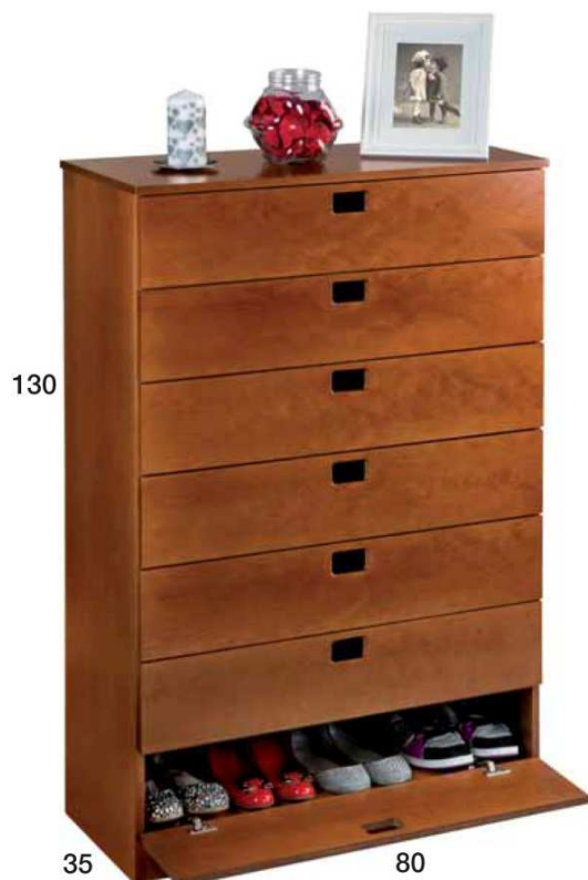
ref. OI7000.01 EAN 8422341201199 7 doors, 28 pairs